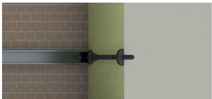
4. Position the Easyvap vapor barrier membrane