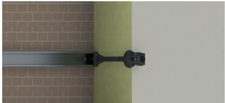
6. Adjust the head of the support then clip it