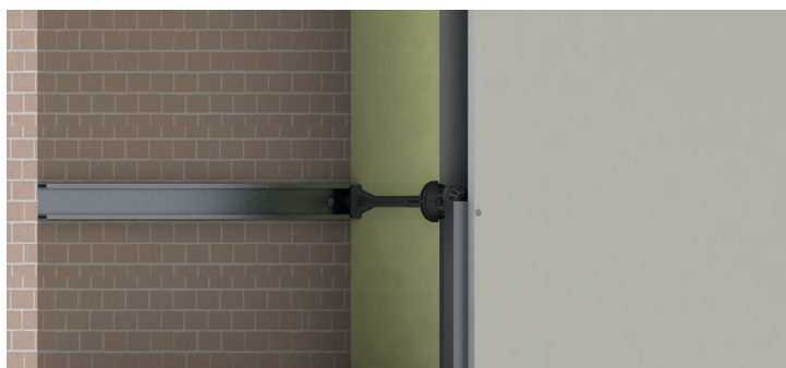
7. Final render

Video link : https://www.youtube.com/watch?v=cxSM9Zxcgwc