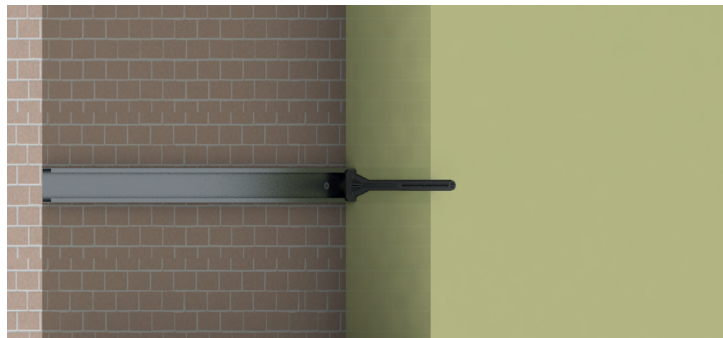
2. Position the insulation