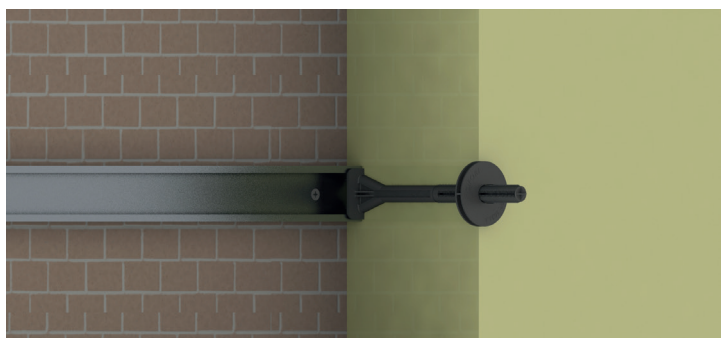
3. Fix the seal